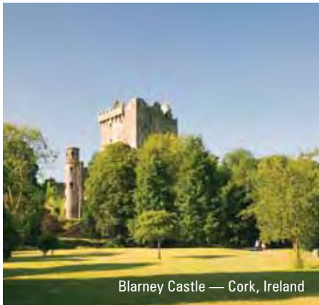
Blarney Castle — Cork, Ireland