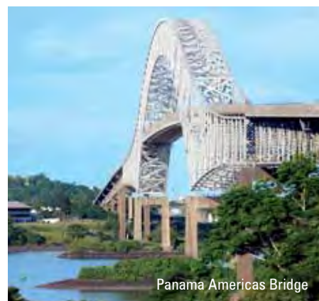
Panama Americas Bridge