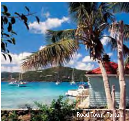
Road Town, Tortola