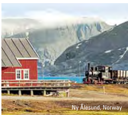
Ny Ålesund, Norway