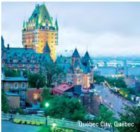
Québec City, Québec