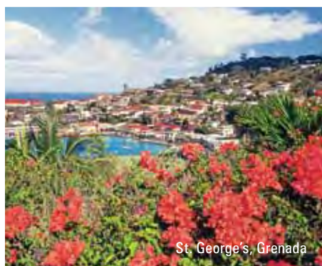
St. George's, Grenada