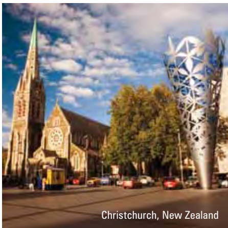
Christchurch, New Zealand

21 days – 20 February 2013, Auckland to Los Angeles option also available. See cunard.com for details.